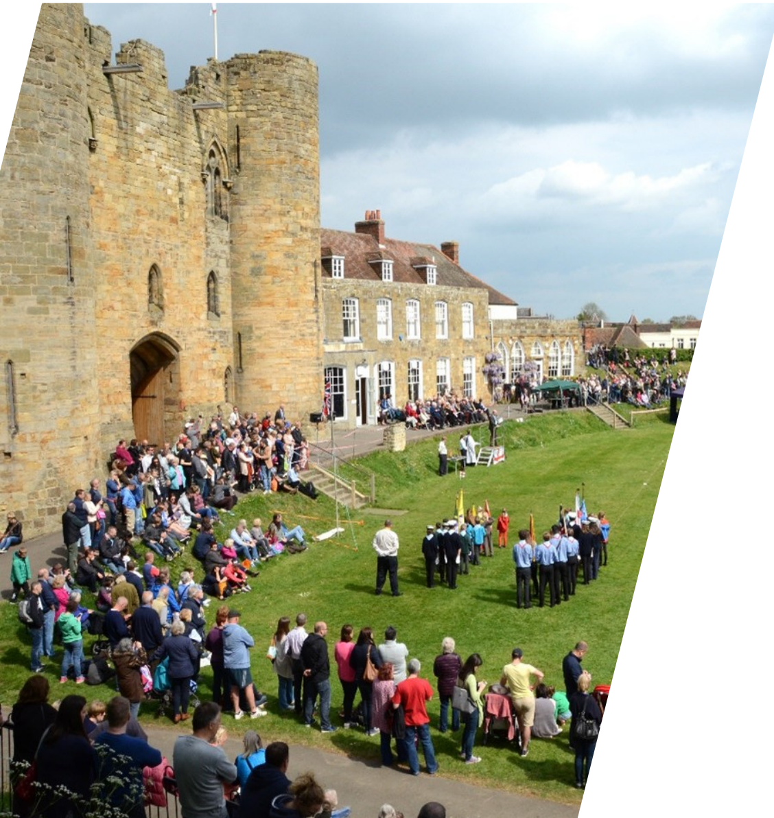
St George's Day parade on Tonbridge castle lawn